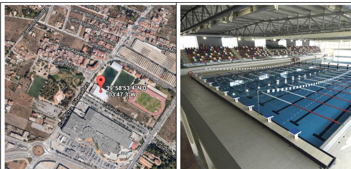
Location Map and Coordinates

The facility has a cafeteria, gym and MD service..